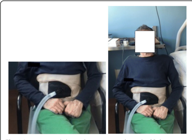
Fig. 2 Intermittent abdominal pressure ventilation by PBelt

Limitations include the fact that its efficiency depends upon the surface area of the chest and the abdomen covered. Since the increase of lung volume is generated by gravity, it is effective only in the sitting position [82], or at least at an angle of 30° or greater [44]. It is usually not sufficiently effective for very obese or severely scoliotic patients [79]. The current device on the market allows