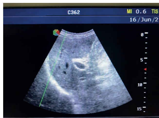
Figure 1. Right diaphragm visualization by B-mode ultrasound. The diaphragm is seen as a thick white line moving with respiration. The liver is used as an echogenic window.

Totally, 757 healthy subjects with normal spirometry were included in this study [478 men (63.14%) and 279 women (36.86%)]. The mean age of the study population was 45.17 \pm 14.84 years. Men were significantly older, had significantly higher FVC% and VT%, while women had significantly higher body mass index (BMI) and better FEF25-75% (Table 1). There was a statistically significant difference between right and left diaphragmatic excursion among all studied subjects (Table 2). The ratio of right to left diaphragmatic excursion during quiet breathing was (1.009 \pm 0.19) ; maximum 181% and minimum 28%. Only 19 cases showed a right to left ratio less than 50% (5 men and 14 women). Right diaphragm-